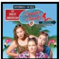
Los Altos Stage Company Presents THE GREAT