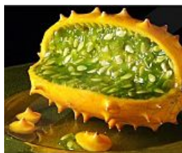
1 Super Food That Burns Stored Fat Like A Furnace Garcinia Cambogia