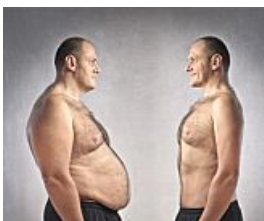
Why It's So Hard to Lose Weight: Hormones Are the Key Real Dose