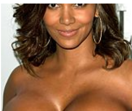
16 Celebs Who Have Breast Implants And Don't Hide It! POPnHOP