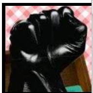
Central Works to Close Season with RECIPE, Opening