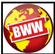
California Shakespeare Theater Sets 2015