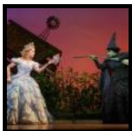
BWW Reviews: WICKED Defies Gravity Once Again