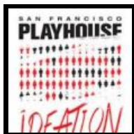
San Francisco Playhouse to Open 12th Season with